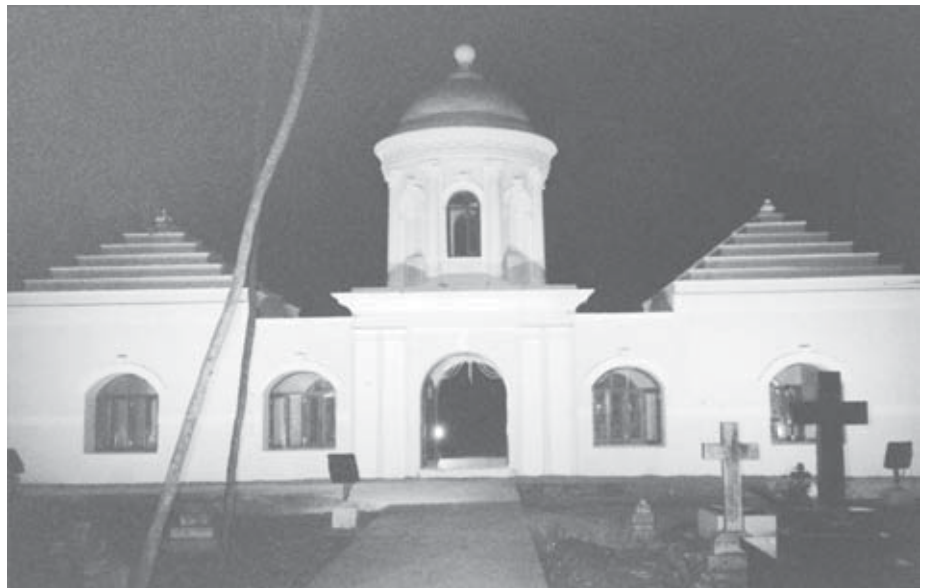
The restored Gateway.

It is to be hoped that the cemetery on The Island of St. Mary's in the Fort will follow suit.