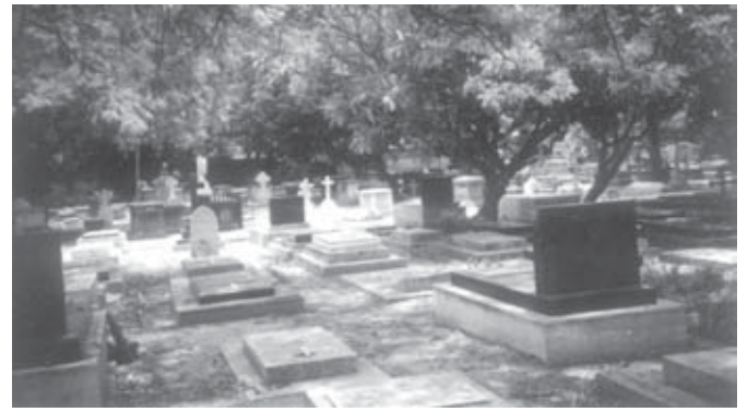
The St. George's Cathedral Cemetery.