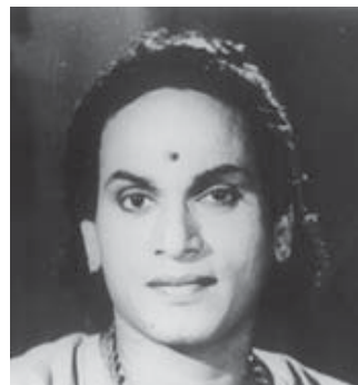
M.K. Thiagaraja Bhagavathar

As one whose family members have lived in Purasawalkam for 90 years and had known well both the renowned author R.K. Narayan and the famous Tamil film star M.K. Thiagaraja Bhagavathar, may I suggest that Government honour them by installing statues in their honour at Purasawalkam? Why Purasawalkam?