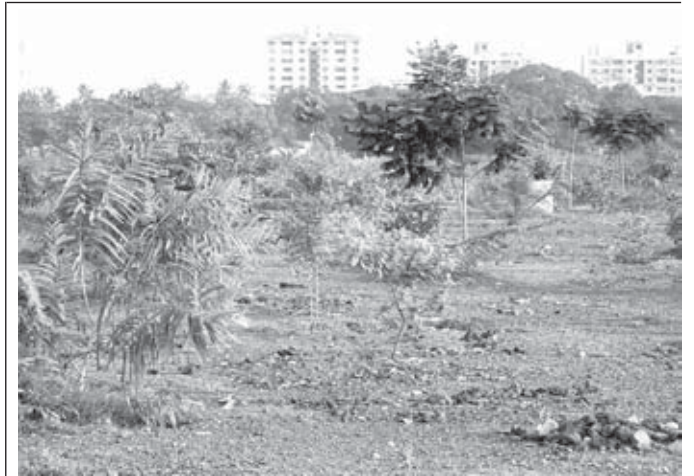
A garbage dump being converted into a forest.

Those interested in browsing the MM archives can visit the Roja Muthiah Reference Library, Central Polytechnic Campus, Taramani, Chennai 600113, or contact them on the telephone at 22542551/2 and seek information.