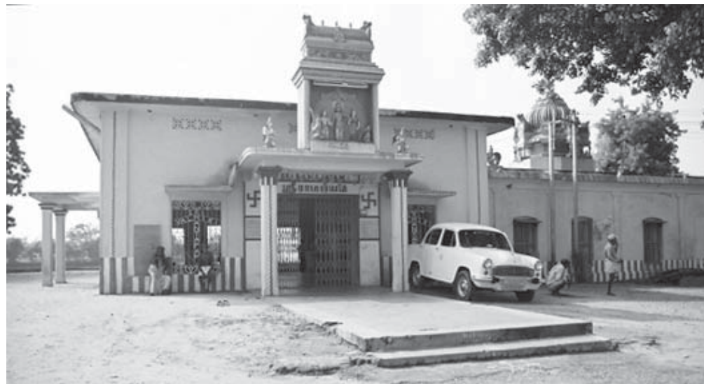
The Tyagaraja Samadhi in Tiruvayyaru.